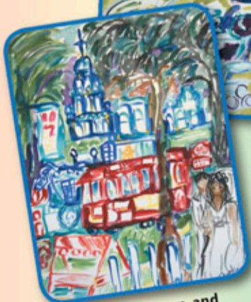
Bride Groom and Cathedral Skies